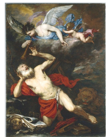
Vuvuzelas...annoying the living suitcase out of people since 1660.