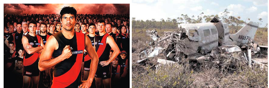
The Essendon Bombers' season has nose-dived after pockets of promise were offered earlier in 2010. Thank Hird for Port Adelaide and the West Coast Coolers!